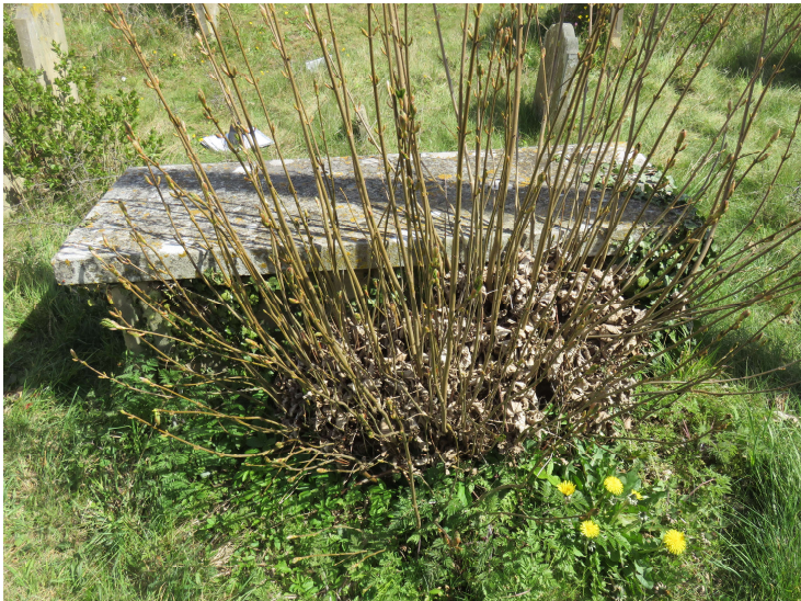
Shrub growth obscuring and threatening a table tombstone (No. 6)