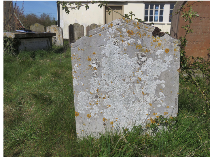
The effects of lichen growth (No. 10)