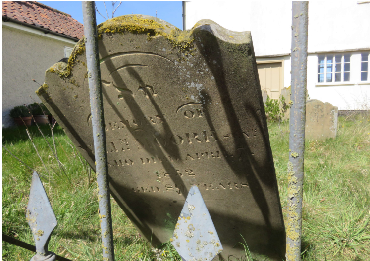
A leaning headstone, in danger of collapse (No. 9)