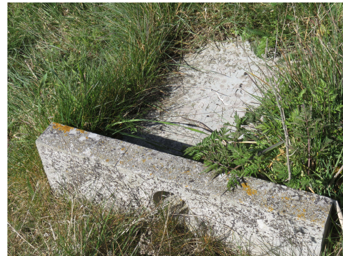
A collapsed headstone being 'swallowed' by grass (No. 45)